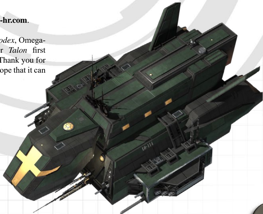
Lelantos-Omega command & control ship

The fifth in the “Refit” series of Armada Codex , Omega-Zed is derived from the bounty hunter Talon first presented in issue #16 of Future Armada . Thank you for taking the time to consider this product - I hope that it can be of service to you and your campaign.